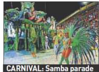
CARNIVAL: Samba parade

"I was a bit shocked when I received the invitation. I am not a voluptuous Brazilian woman. I have a lot of respect for the carnival queens. They are unbelievable."